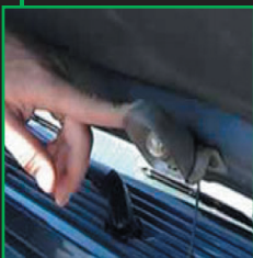
Mercury switches are small, about the size of a new acorn.

The Environmental Protection Agency (EPA) has announced the "National Vehicle Mercury Switch Recovery Program" that it says will help cut mercury air emissions by up to 75 tons over the next 15 years.