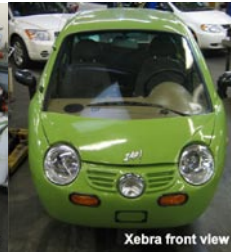
Xebra front view