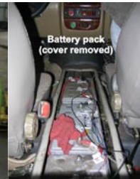
Battery pack (cover removed)