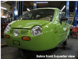
Xebra front 3-quarter view