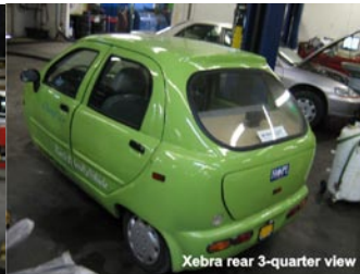
Xebra rear 3-quarter view