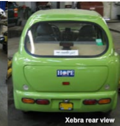
Xebra rear view