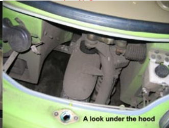
A look under the hood