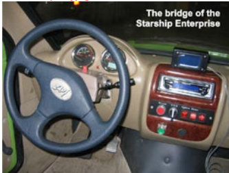
The bridge of the Starship Enterprise