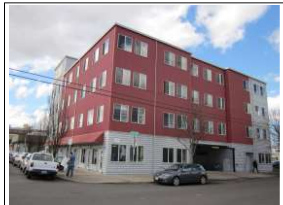
The XRAY-FM studio complex. Their office is on the street under the awning on the left

Our first impression when we pulled up to the 4-story XRAY studio building was disappointment that their $103,000 in Kickstarter funding had already been blown on luxury office space, but an inquiry at the front office quickly showed us our error. The ActiveSpace building in Southeast Portland is home to many small companies and startups, and XRAY is just one of the many. Far from blowing their money, they're obviously nursing it wisely. XRAY's studio is just a tiny office in ActiveSpace, about 10'x20'.