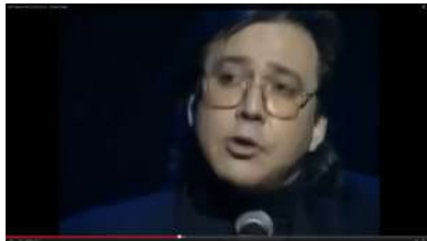
1991 show at Montreal's Centaur Theatre