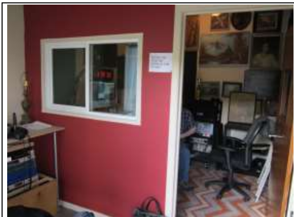
The cavernous home of XRAY-FM. We're standing in the producer's room, looking into the studio

divided off to form a producer's area and the rear is where the hosts and DJs will be.