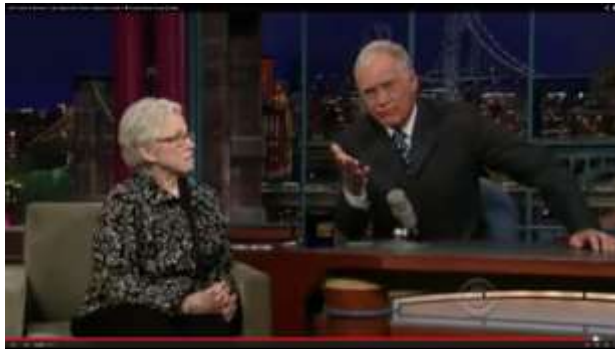
Bill's banned performance on David Letterman

(PS- Like Carlin, Bill could be a little rough when it came to language. Most of these clips have words that may be new to innocent ears. Be careful.)