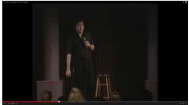
1989 show at Laft Stop in Austin, Texas