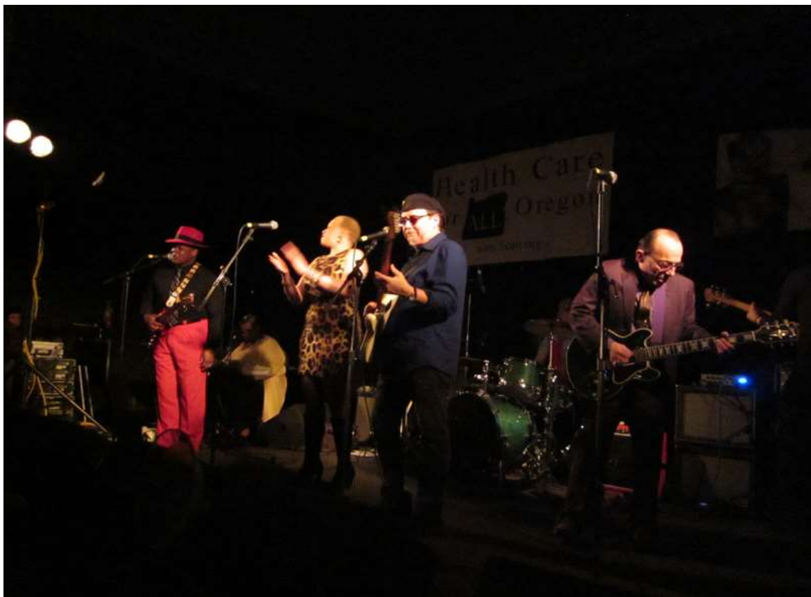
An amazing blues jam on the main stage

April 5 was the third year for the blues festival with the longest name ever- the "Inner City Blues Festival Reunion In Support Of Single Payer Health Care." It was also our third year supporting the event, so we thought we'd give you a taste of what you missed. We've got pictures, and even a minute-and-a-half recording from the big blowout closing number. More importantly, you'll find a couple links to follow if you'd like to help bring Single Payer to Oregon. Don't spend the rest of this year kicking yourself because you missed the show... give a couple dollars to the Single Payer campaign, rock out on the video, and start making your plans for next year!