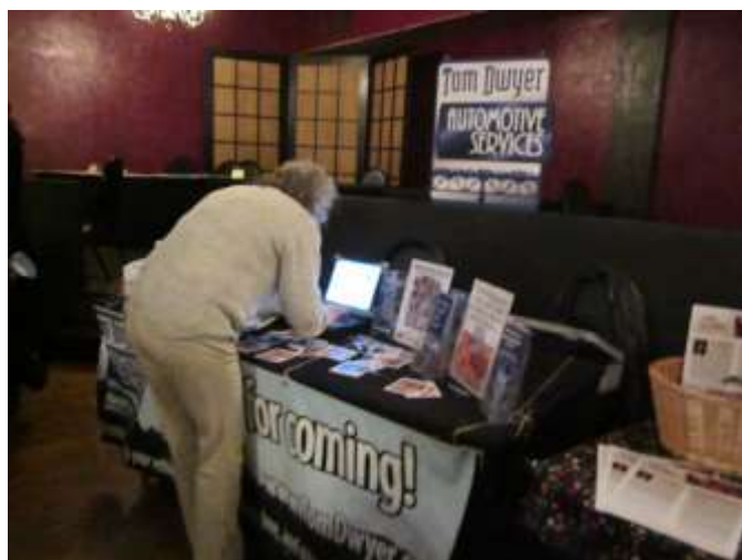
Our newest client signs up at the Tom Dwyer table