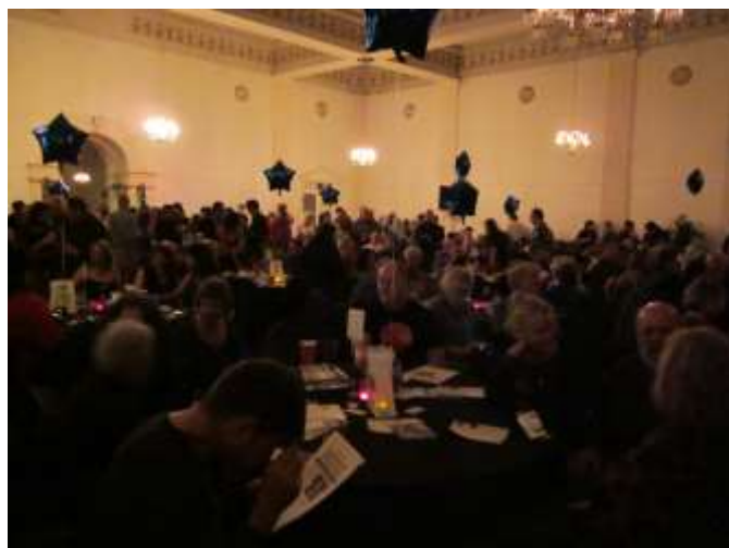
...and the rest of the folks in the main ballroom