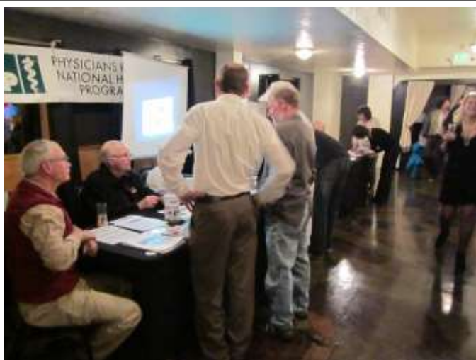
People take time out to support SINGLE PAYER!

Click here to go to the Health Care for All Oregon website so YOU can help support SINGLE PAYER HEALTHCARE in Oregon!