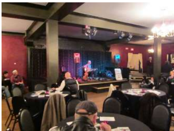
Blues on the basement stage

Click here to go to the Health Care for All Oregon website so YOU can help support SINGLE PAYER HEALTHCARE in Oregon!