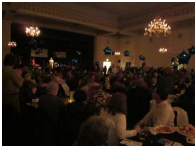
The crowd looking toward the stage