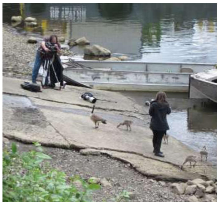
Photographers for the demolition had a field day with the geese on the boat ramp.

Workers taking down old Sellwood Bridge from KGW