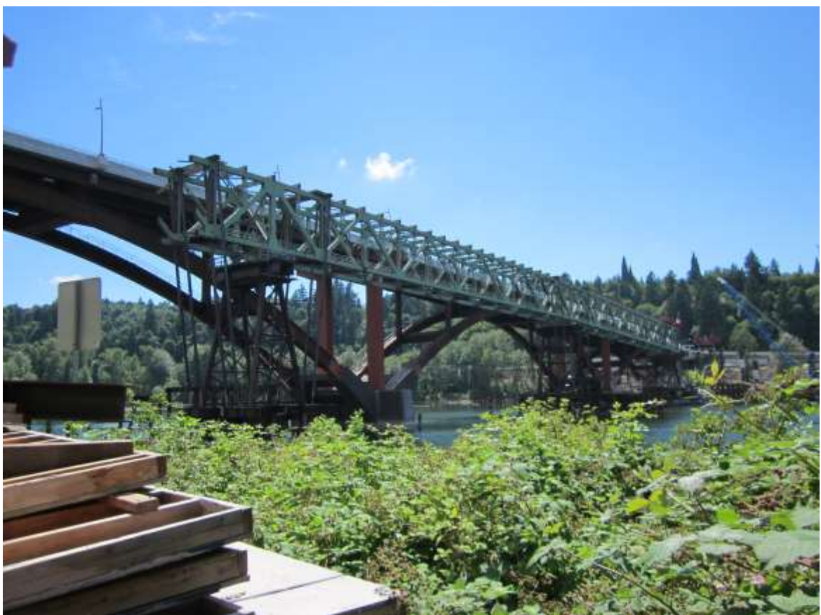
The sections in the center of the river are all that's left!