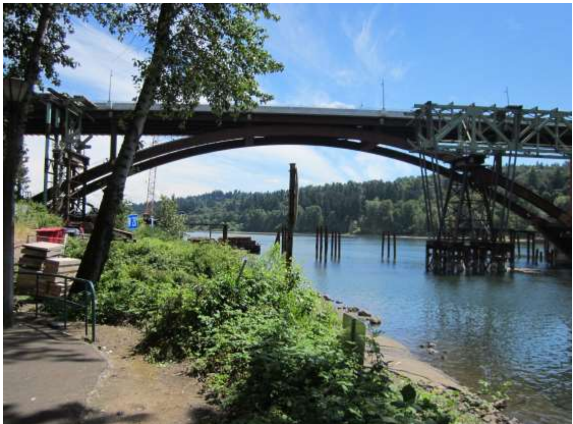
The East end of the Bridge emerges from its chrysalis.