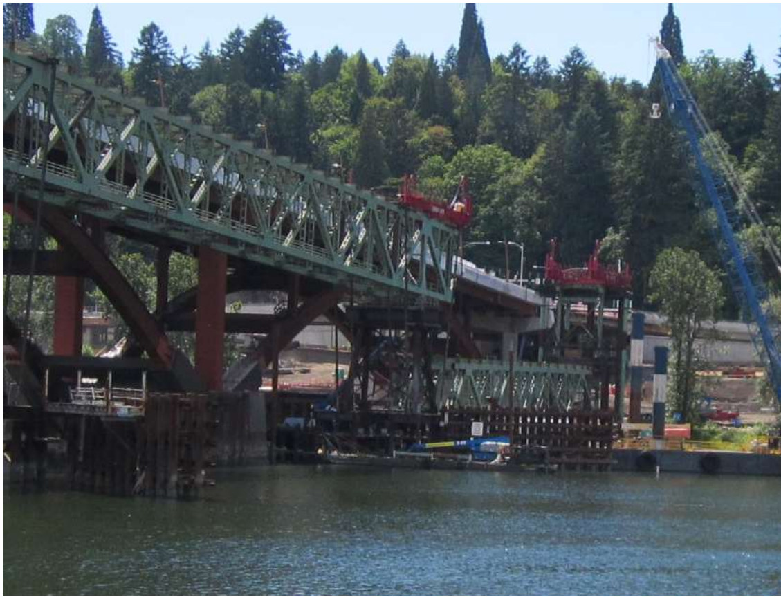
West side section being lowered onto barge.