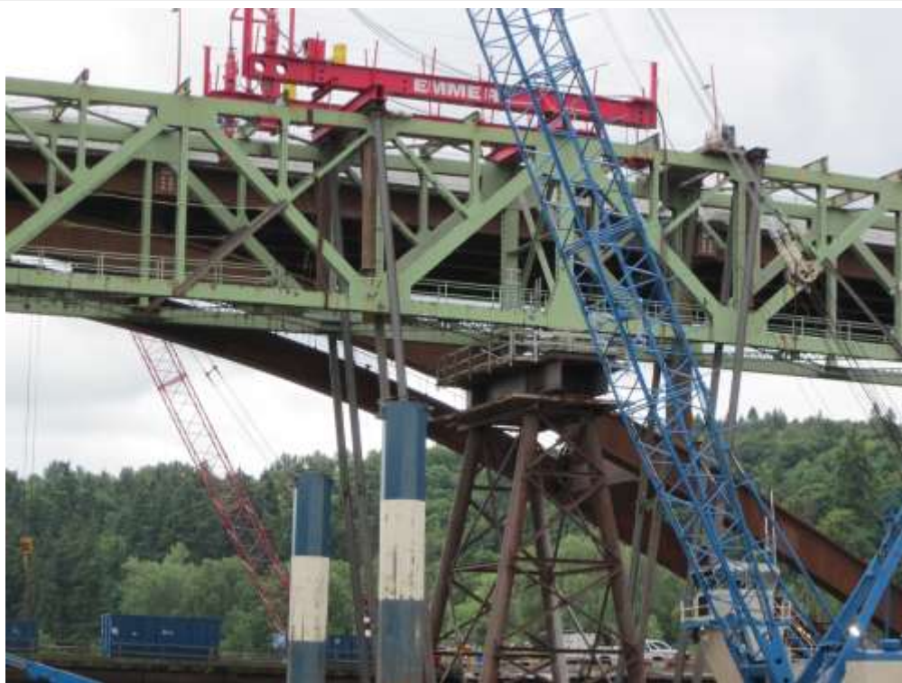
Closer view of the lowering equipment.