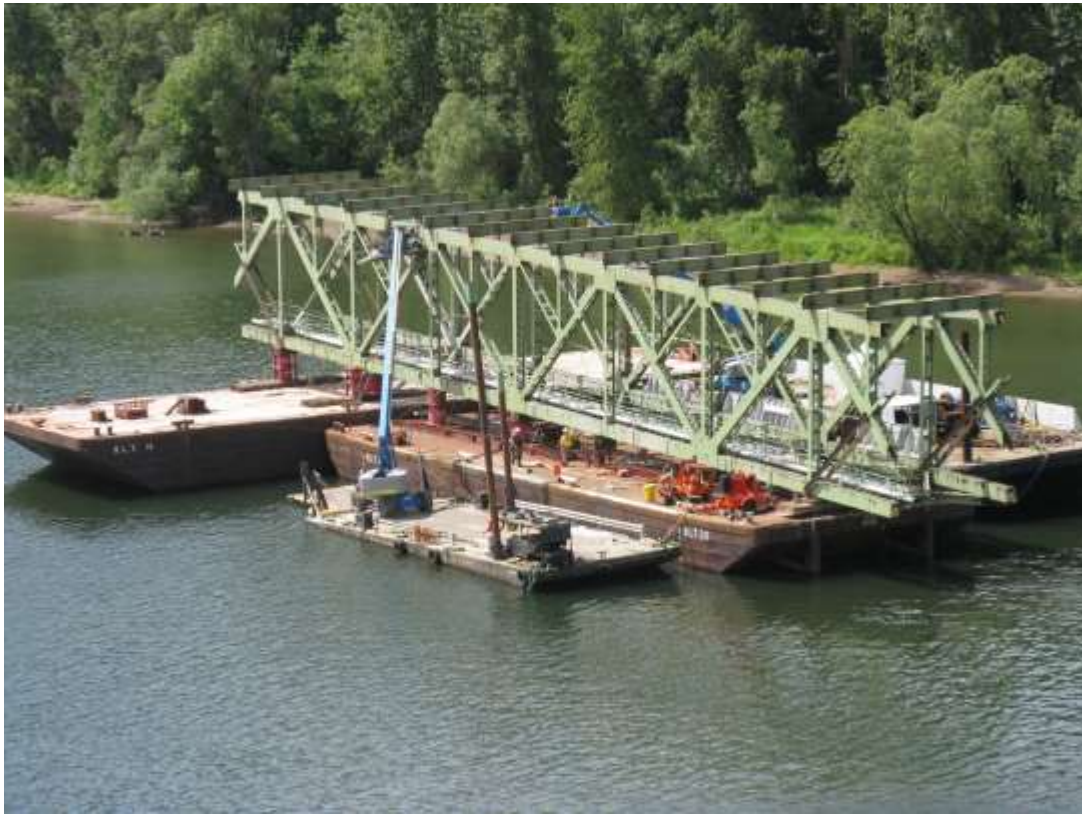
First section on its way to recycling upriver.