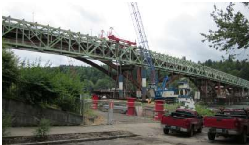
Final situation before the first steel segment starts coming down.

The biggest thing lately was the removal of the steel structure of the old bridge. The Bridge Project attempted to find someone to use the old bridge as an intact structure; possibly as a span across a much shorter distance. No takers. Instead, this being Portland, the old steel will be recycled at Schnitzer Steel. The old bridge will be cut into four sections, each about 250' long, and lowered onto barges for the trip upriver. As of this writing the East and West sections are gone, leaving the two spans in the center of the river to go. Here's some pictures of the removal, along with much more detailed information from local news sources.