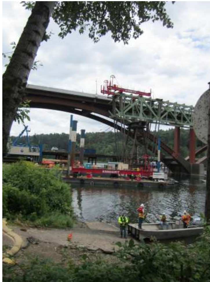
Workers pull to the dock after the East section is removed.